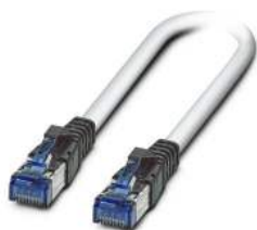
Patch cable, CAT6, preassembled, 1.0 m

https://www.phoenixcontact.com/us/products/2891385