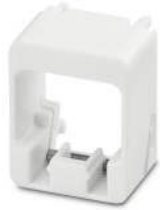
Plug Guard Security Frame

Please be informed that the data shown in this PDF document is generated from our online catalog. Please find the complete data in the user documentation. Our general terms of use for downloads are valid.