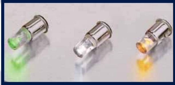
(Center Contact Negative)