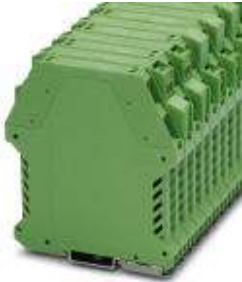
Housing upper part, for printed circuit terminal block connection

Please be informed that the data shown in this PDF Document is generated from our Online Catalog. Please find the complete data in the user's documentation. Our General Terms of Use for Downloads are valid ( http://download.phoenixcontact.com )