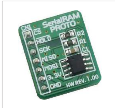
Figure 1: Serial RAM PROTO