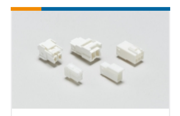
Rectangular Power Connectors(479)