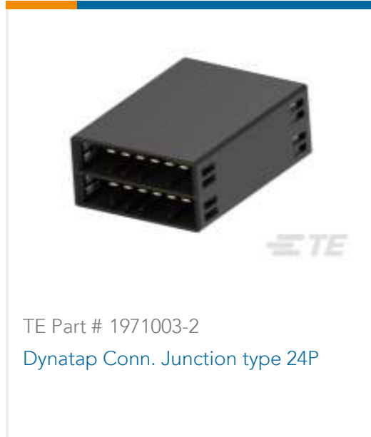
TE Part # 1971003-2 Dynatap Conn. Junction type 24P