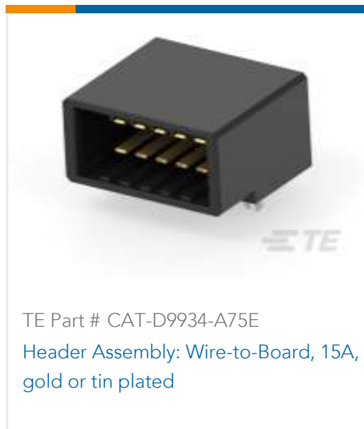
TE Part # CAT-D9934-A75E Header Assembly: Wire-to-Board, 15A, gold or tin plated