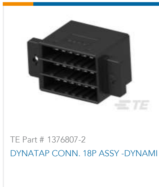
TE Part # 1376807-2 DYNATAP CONN. 18P ASSY -DYNAMI