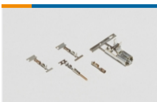
Wire-to-Board Connector Contacts(91)