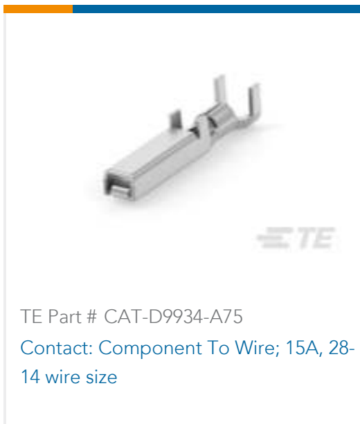
TE Part # CAT-D9934-A75 Contact: Component To Wire; 15A, 28-14 wire size