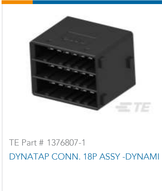
TE Part # 1376807-1 DYNATAP CONN. 18P ASSY -DYNAMI