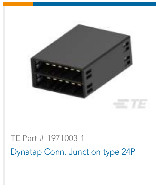
TE Part # 1971003-1 Dynatap Conn. Junction type 24P