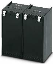
Replacement battery for UPS-BAT/VRLA... energy storage

Please be informed that the data shown in this PDF Document is generated from our Online Catalog. Please find the complete data in the user's documentation. Our General Terms of Use for Downloads are valid ( http://phoenixcontact.com/download )