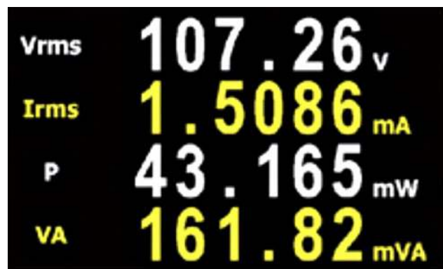
Simple Mode (4 Measurements)

T3PM1006 provides two display modes for various measuring situations. Standard mode displays 8 measurement parameters (2 major measurements + 6 secondary measurements) and related measurement setting parameters which is ideal for applications in R&D, design, and engineering verification. Simple mode displays four measurement parameters which can be useful in production environments.