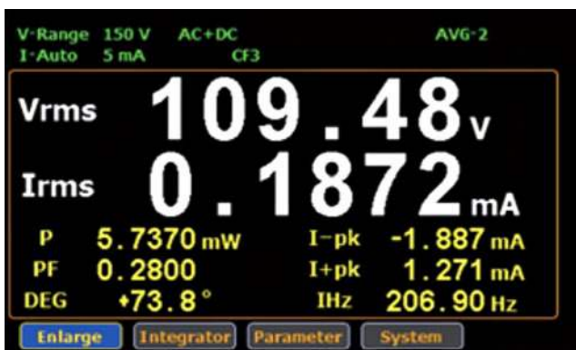
Standard Mode (Setting & 8 Measurements)