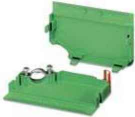
Cable housing, Pitch: 0 mm, Number of positions: 22, Dimension a: 110 mm, Color: green

Please be informed that the data shown in this PDF Document is generated from our Online Catalog. Please find the complete data in the user's documentation. Our General Terms of Use for Downloads are valid ( http://phoenixcontact.com/download )