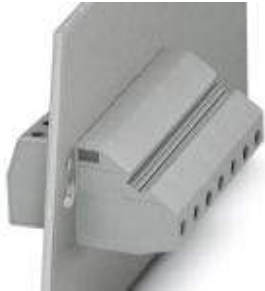
Panel feed-through terminal block, Connection method: Screw connection, Number of positions: 1, Color: green-yellow

Please be informed that the data shown in this PDF Document is generated from our Online Catalog. Please find the complete data in the user's documentation. Our General Terms of Use for Downloads are valid ( http://phoenixcontact.com/download )