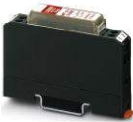
Rail-mountable module with surge voltage fine protection, mounting on NS 35/7.5. Nominal voltage: 24 V DC, housing width: 12.5 mm

Please be informed that the data shown in this PDF Document is generated from our Online Catalog. Please find the complete data in the user's documentation. Our General Terms of Use for Downloads are valid ( http://download.phoenixcontact.com )