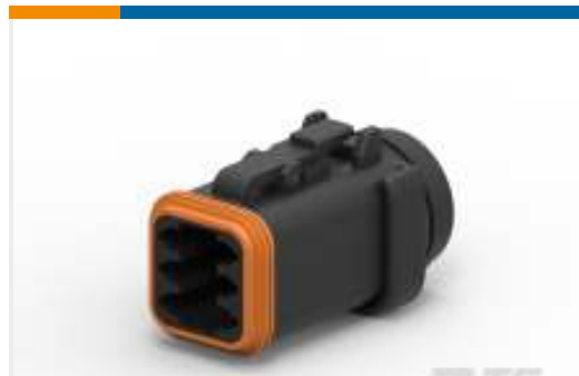
TE Part #DT06-6S-LC01 PLG, 6P, BLK, E, SEAL RET, DIN BKSHL ADPT