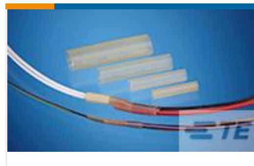
TE Part #CB88166002 RBK-VWS-125-NR1-X-100MM