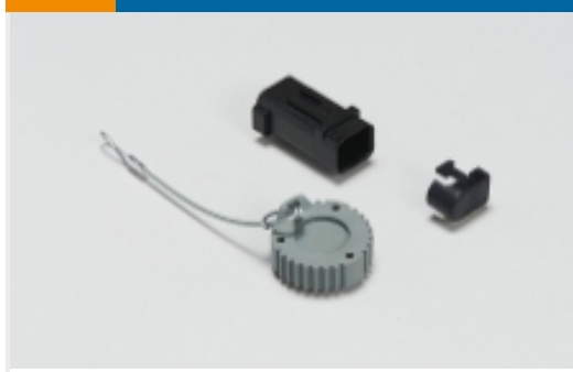
Automotive Connector Caps & Covers (107)