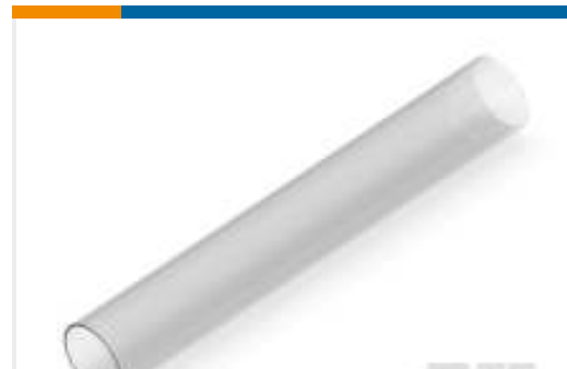
TE Part #3336796001 RBK-ESS-CROSS-10.0-X-8MM