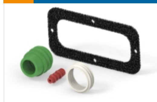
Connector Seals & Cavity Plugs(6)