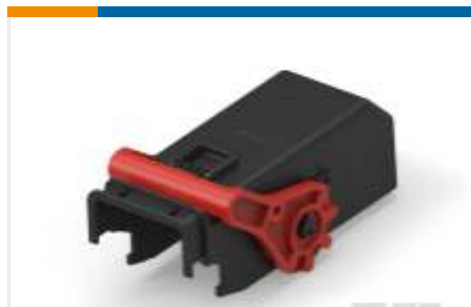
TE Part #2360002-1 REC CONN CVR ASSY, 96POS, AMP MCP 2.8