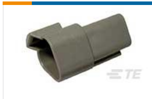
TE Part #DT04-3P-P004 REC, 3P, GRY, N