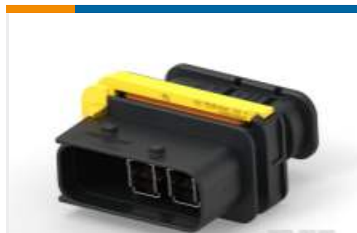
TE Part #9-2348782-1 HD MATEnet 2+6 TAB HSG ASSY, GRP E