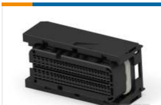
TE Part #2359941-6 96POS, MCON-1.2 CB, REC HSG, ASSY