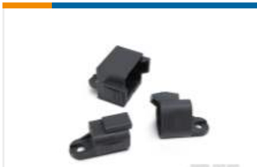
TE Part #1011-349-1205 Dust Caps — DEUTSCH DT