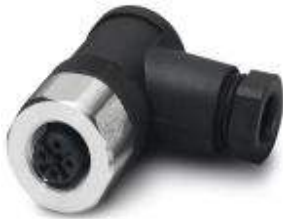
Sensor/actuator connector, female, angled, 5-pos., M12, screw connection, high-grade steel knurl, cable screw connection Pg7

Please be informed that the data shown in this PDF Document is generated from our Online Catalog. Please find the complete data in the user's documentation. Our General Terms of Use for Downloads are valid ( http://download.phoenixcontact.com )