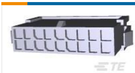
TE Part #1-794615-8 PANEL MT DBL ROW HSG 18 POS