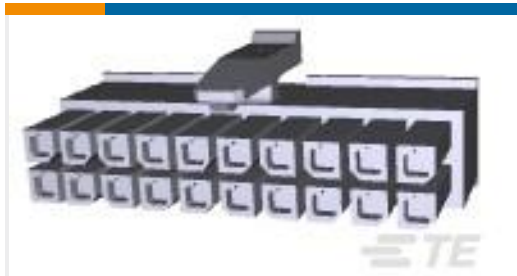
TE Part #2-794617-0 20POS,MICRO MNL,RCPT HSG