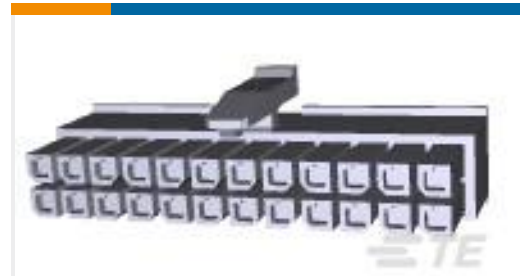
TE Part #2-794617-4 24POS,MICRO MNL,RCPT HSG