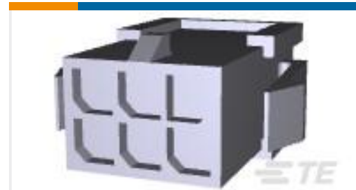
TE Part #794615-6 PANEL MT DBL ROW HSG 6 POS