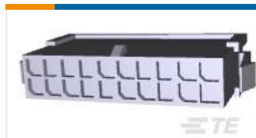
TE Part #2-794615-0 PANEL MT DBL ROW HSG 20 POS