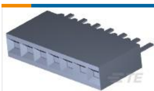
TE Part #5-534237-5 07 MODII VRT SR CE 100/115