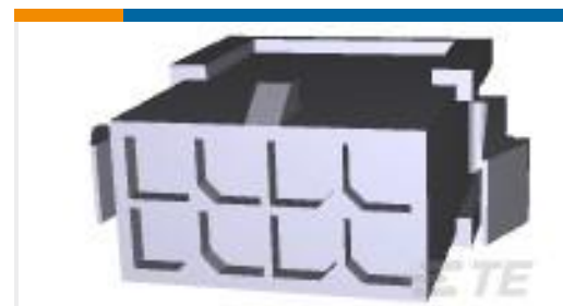
TE Part #794615-8 PANEL MT DBL ROW HSG 8 POS