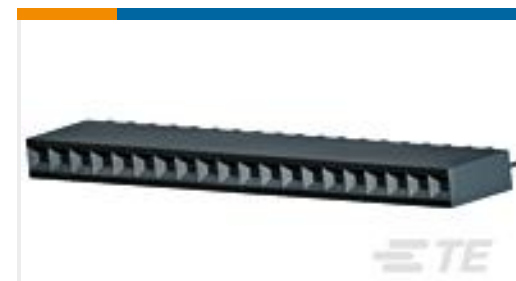
TE Part #1-534237-8 20 MODII VRT SR CE 100/115