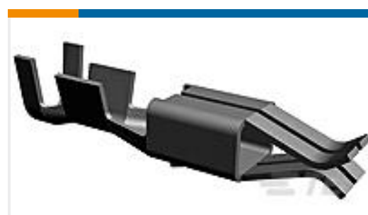
TE Part #927871-1 JUNIOR-TIMER KONT