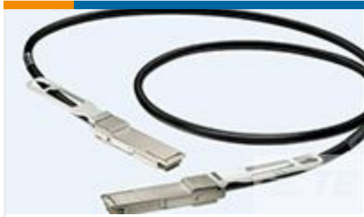
TE Part # 2829040-7 QSFP IB EDR, 26AWG, 2.0M