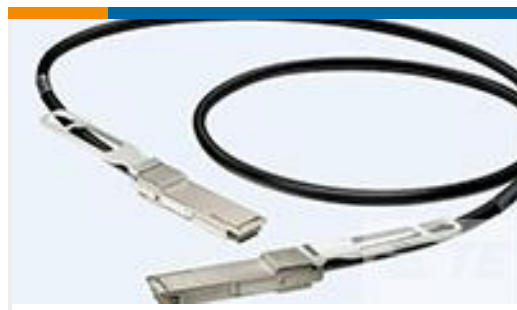
TE Part # 2829040-2 QSFP IB EDR, 33AWG, 1.0M