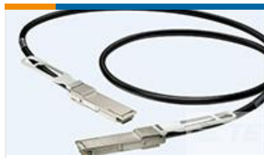
TE Part # 2829040-4 QSFP IB EDR, 30AWG, 1.0M