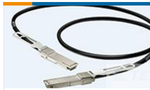
TE Part # 2829040-6 QSFP IB EDR, 30AWG, 2.0M