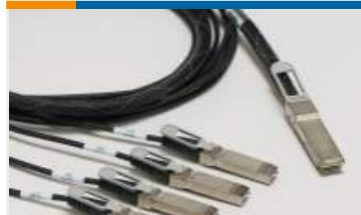
TE Part # 2821033-8 QSFP TO [4]SFP+, 28G, 1M, 33AWG