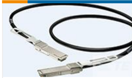
TE Part # 2829040-8 QSFP IB EDR, 26AWG, 3.0M