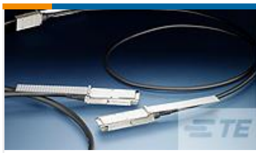
TE Part # 2202165-5 QSFP TO QSFP, 26AWG, FDR, 5.0 METER