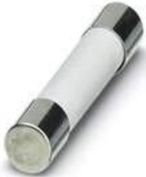
Fuses for ME-ELR module electronics (Midget/ 10.3 x 38)

Please be informed that the data shown in this PDF Document is generated from our Online Catalog. Please find the complete data in the user's documentation. Our General Terms of Use for Downloads are valid ( http://phoenixcontact.com/download )