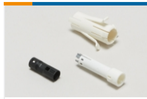
Plug &amp; Socket Lighting Connector Accessories(57)