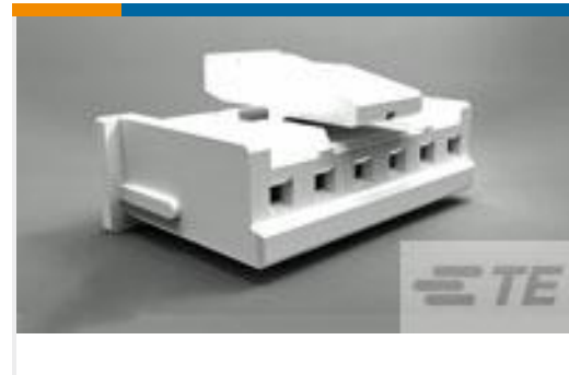
TE Part #1969442-4 EP 2.5 TPA Housing, 4 Pos