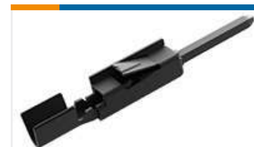
TE Part #1740335-1 MICRO QUADLOK SYSTEM PIN CONTA