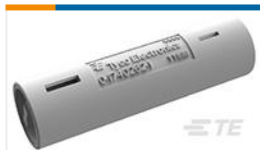
TE Part #1740262-1 NECTOR S OUTLET HV-1 WHITE