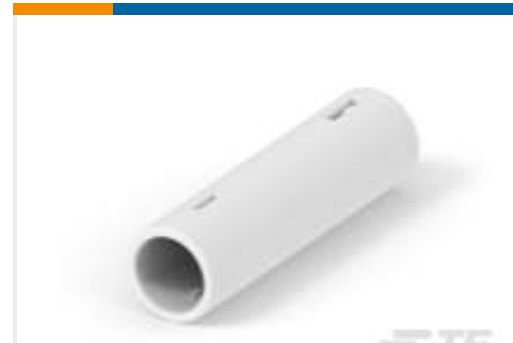
TE Part #293387-2 NECTOR S OUTLET HV-4 WHITE