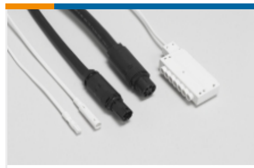
Lighting Cable Assemblies(1)