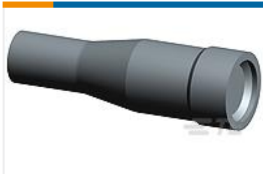
TE Part #293284-1 NECTOR S BUS BAR BOOT