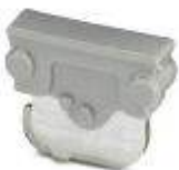
Spare knife, Length: 10.5 mm, Width: 4 mm, Color: gray