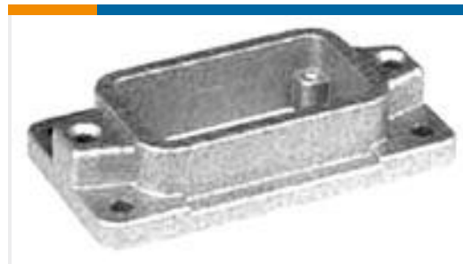
TE Part #2-1102606-5 HIP-K.6/16.AG.M6