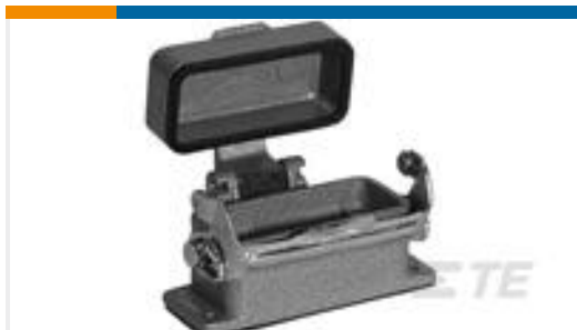
TE Part #1-1102122-2 HA.10.AGD-LB