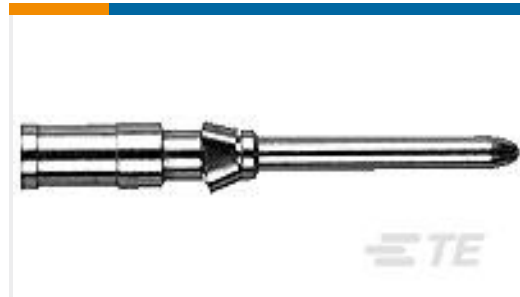
TE Part #4-1105050-2 HN.D-C-STI.AU.1,5