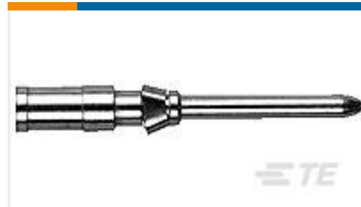
TE Part #4-1105050-1 HN.D-C-STI.AG.1,5