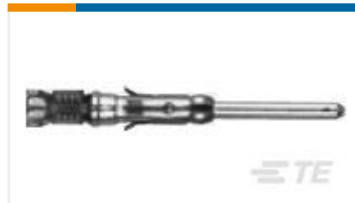
TE Part #3-1105000-2 HD.M-C-STI.AU.0,8