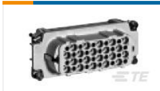
TE Part #2-1103111-3 HN.D.40.Bu.C