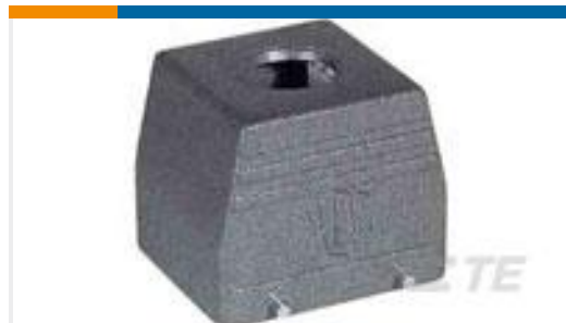
TE Part #2-1102351-6 HB-K.32.STO.1.29.G