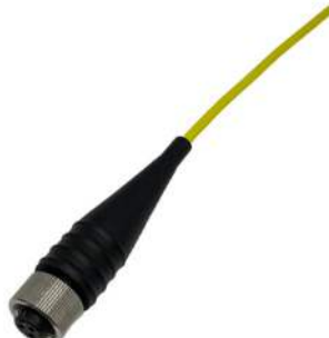
CMCP603H 3 Socket Locking Collar