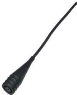
CMCP602HST Push On IP68 Connector