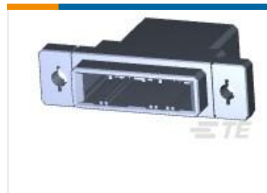
TE Part #1-178802-5 DYNAMIC3100S TAB HSG 5P PM X-K