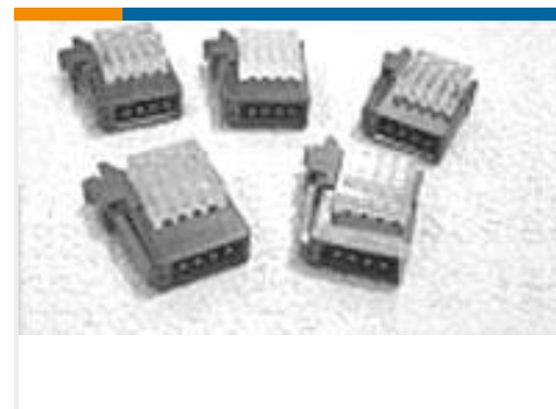
TE Part #4-1473562-6 RITS CONN. PLUG ASSY 6P GREEN