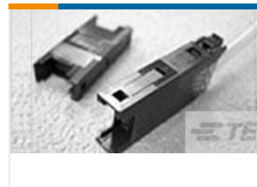
TE Part #5-1473571-3 RITS.JUNCTION BOX 2D 3P F/H