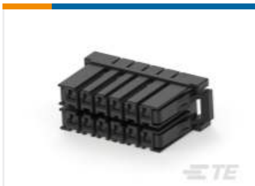
TE Part #2-179553-2 Receptacle and Tab Housing: 5.08 mm Pitch, 250-600V