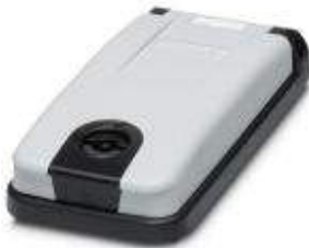
Mounting frame for one front plate/socket, frame: black, cover: gray, closed with 3 mm two-way key bit.

Please be informed that the data shown in this PDF Document is generated from our Online Catalog. Please find the complete data in the user's documentation. Our General Terms of Use for Downloads are valid ( http://phoenixcontact.com/download )