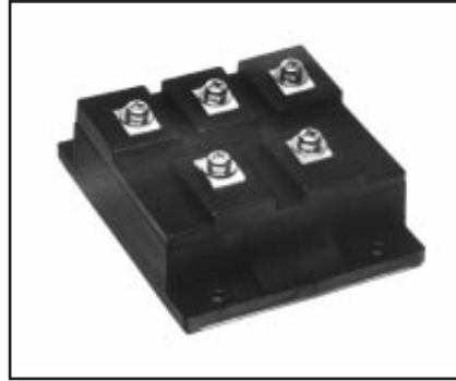
ME600815 Three-Phase Diode Bridge Modules 150 Amperes/800 Volts