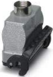
HEAVYCON B16 coupling housing, with single locking latch, height: 70.5 mm, with 1 x Pg21 gland, straight cable outlet

Please be informed that the data shown in this PDF Document is generated from our Online Catalog. Please find the complete data in the user's documentation. Our General Terms of Use for Downloads are valid ( http://phoenixcontact.com/download )