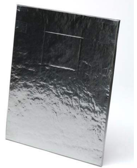
Table 1. Standard U-Vacua™ Standard Sizes + R-value

Technology: The majority of a VIP's insulating value is from the inner vacuum. In a vacuum, heat cannot travel through the air by conduction or convection. This limited ability for heat to travel in a vacuum is what gives vacuum insulation panels such a high thermal performance and R-value. As a result, it is important to maintain the integrity of the vacuum, particularly during handling and installation.