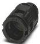
Cable gland, Pg thread, IP68/69k protection, straight

Screw connection - WP-G HF IP69K PG16 BK - 3240877