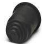
End sleeves, transition sleeves, from hose to cable

Transition sleeve from hose to cable - WP-EC TPE HF 21,2 BK - 3240977