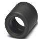
End sleeves as cable protection

Cable protection end sleeve - WP-SC PA HF 21,2 BK - 3240984