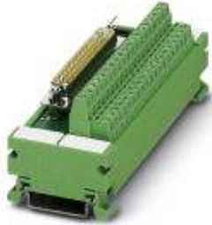
VARIOFACE module, with screw connection and D-subminiature pin strip, for assembly on NS 35/7.5, 37 positions

Please be informed that the data shown in this PDF Document is generated from our Online Catalog. Please find the complete data in the user's documentation. Our General Terms of Use for Downloads are valid ( http://download.phoenixcontact.com )