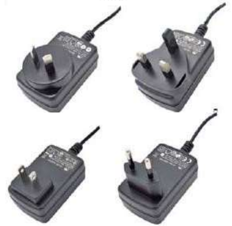
*Product images are for illustrative purposes only and may vary from actual design.