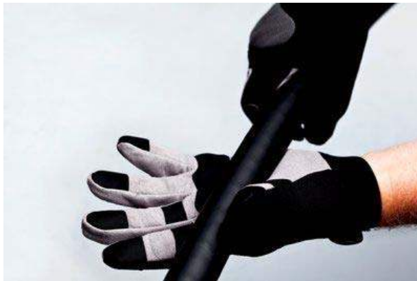
Increase in holding power, while using less force

Constructed with thousands of micro-replicated gripping fingers, 3M™ Gripping Material TB531 provides a lighter, yet tighter grip for maximum hold with minimum effort. Designed to enhance grip and reduce slippage, this product is a firm, but soft, and durable gripping material. Backed with a pressure sensitive acrylic adhesive, this gripping material can bond to a variety of surfaces.