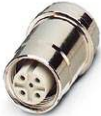
Sensor/actuator flush-type socket, 4-pos., M12, A-coded, front/press-in mounting, with straight solder connection

Please be informed that the data shown in this PDF Document is generated from our Online Catalog. Please find the complete data in the user's documentation. Our General Terms of Use for Downloads are valid ( http://download.phoenixcontact.com )