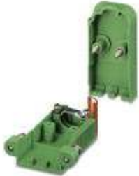
Cable housing, Pitch: 0 mm, Number of positions: 3, Dimension a: 24.66 mm, Color: green

Please be informed that the data shown in this PDF Document is generated from our Online Catalog. Please find the complete data in the user's documentation. Our General Terms of Use for Downloads are valid ( http://download.phoenixcontact.com )