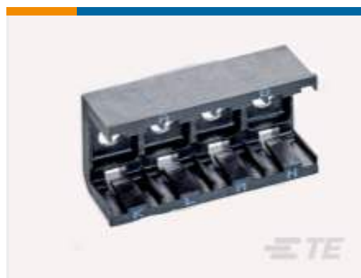
TE Part #DCR-1A-02 COMPOSIT RAIL