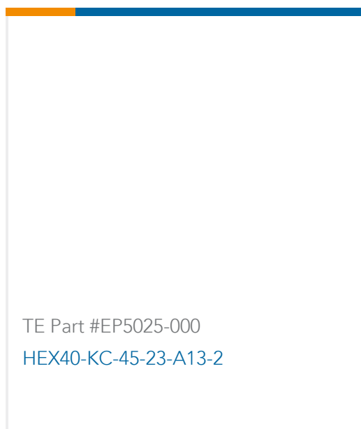
TE Part #EP5025-000 HEX40-KC-45-23-A13-2