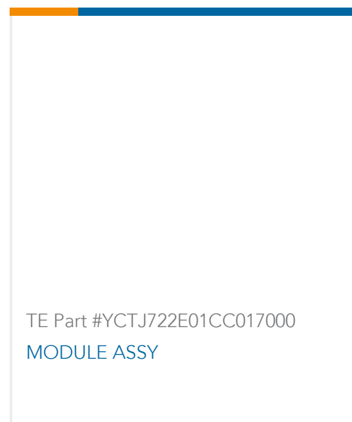
TE Part #YCTJ722E01CC017000 MODULE ASSY