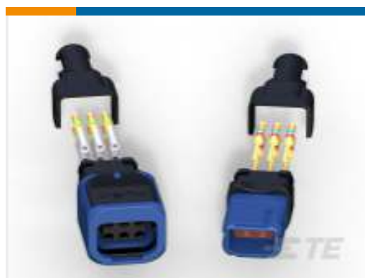
TE Part #YD369-R99-NS300000 369 9 WAY REC, 20/22 CONTACTS, SKT