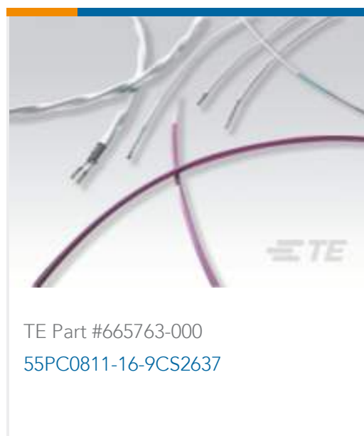
TE Part #665763-000 55PC0811-16-9CS2637