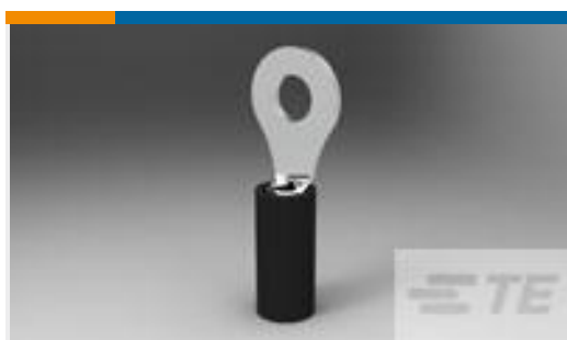
TE Part #50830 TERMINAL,PIDG PTFE R 26-24 6