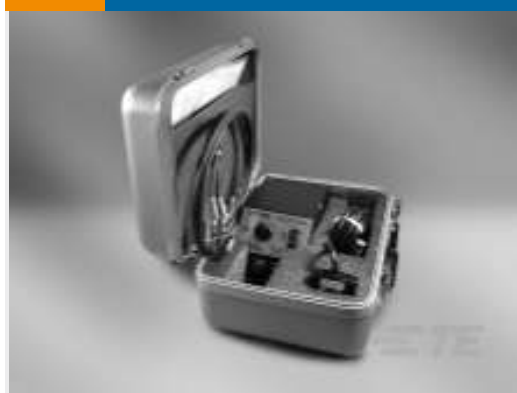
TE Part # 173643-000 RH-3960-1-TINEL-KIT-120V