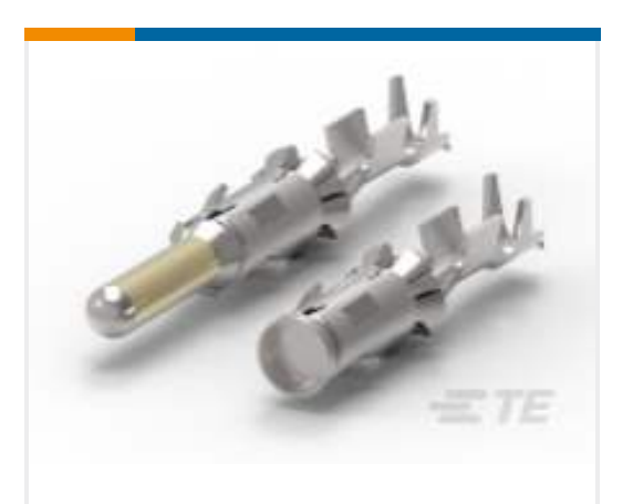
TE Part #929968-1 ROUND CONNECTOR SYSTEM, PIN AND SOCKET