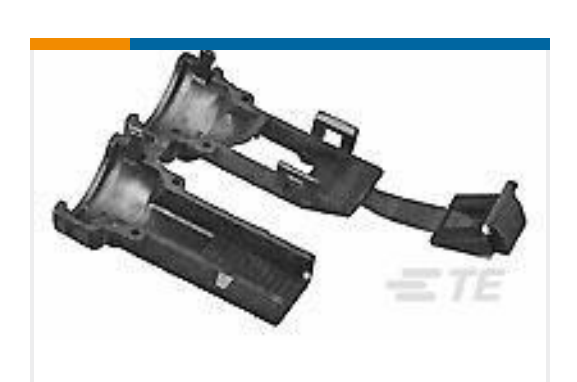
TE Part #965784-1 connector ABDECKKAPPE 180GRD