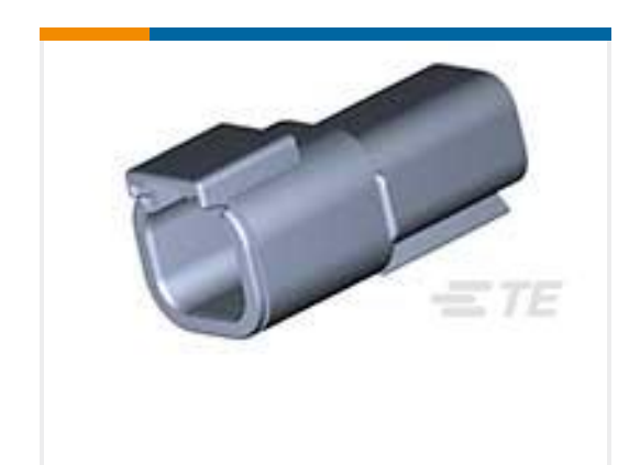
TE Part #DTMH04-4PA REC, 4P, BLK, N, HI TEMP, A