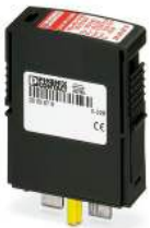
UL Recognized type 1 SPD and IEC type 2 surge protection plug with a varistor and thermal disconnect for use with VAL-US base elements, mechanical and visual fault warning

https://www.phoenixcontact.com/us/products/2910330