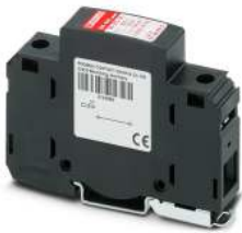
Feed-through terminal block for VAL and FLT applications

https://www.phoenixcontact.com/us/products/2749880