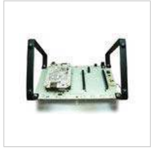
Mounted on Brackets