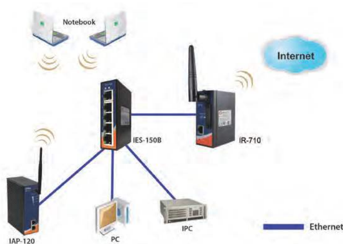
LAN to Mobile Internet Connection

IR-710 can connect LAN to Internet though 3.5G modem! IR-710 provides the best transmission solution for LAN to mobile Internet.