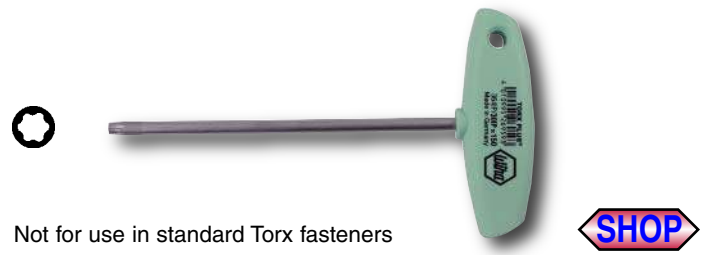
Not for use in standard Torx fasteners

364 TORXPlus® Screwdriver, With Wiha-T-handle Blade high alloy chrome-vanadium-molybdenum steel, hardened, hard chromed. Wiha-T-handle high quality plastic, impact resistant.