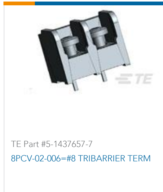
TE Part #5-1437657-7 8PCV-02-006=#8 TRIBARRIER TERM