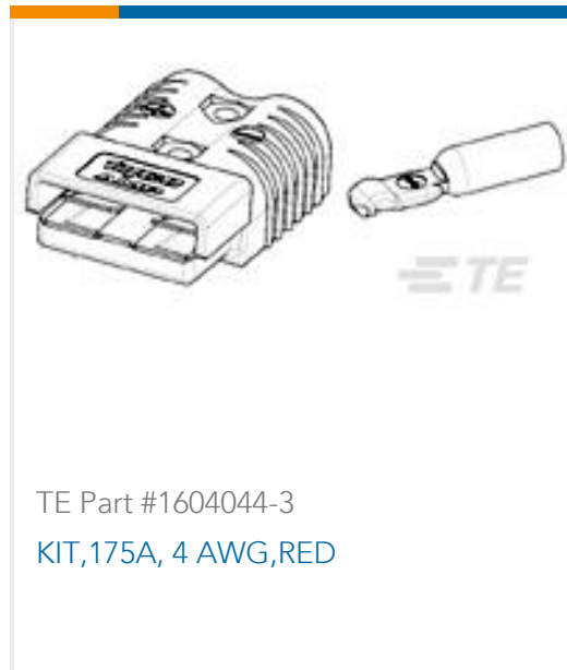
TE Part #1604044-3 KIT,175A, 4 AWG,RED