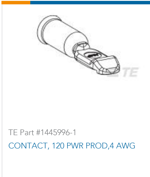
TE Part #1445996-1 CONTACT, 120 PWR PROD,4 AWG