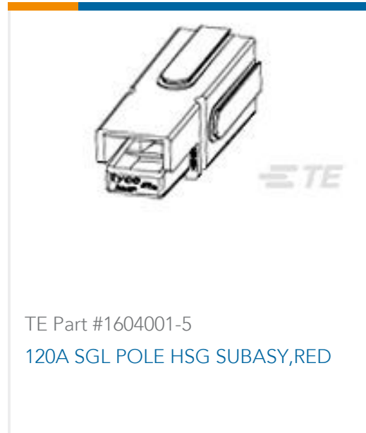
TE Part #1604001-5 120A SGL POLE HSG SUBASY,RED