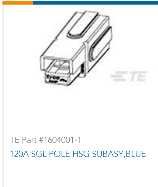
TE Part #1604001-1 120A SGL POLE HSG SUBASY,BLUE