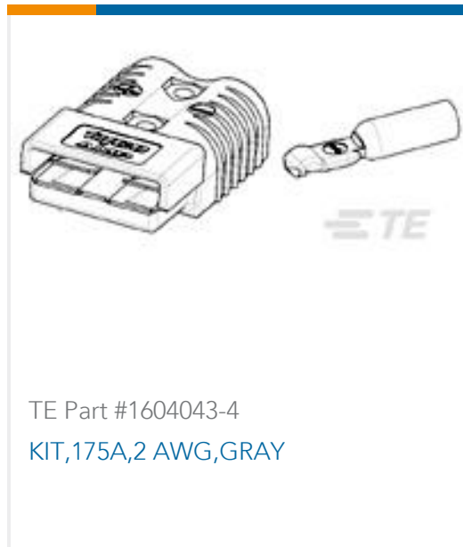
TE Part #1604043-4 KIT,175A,2 AWG,GRAY