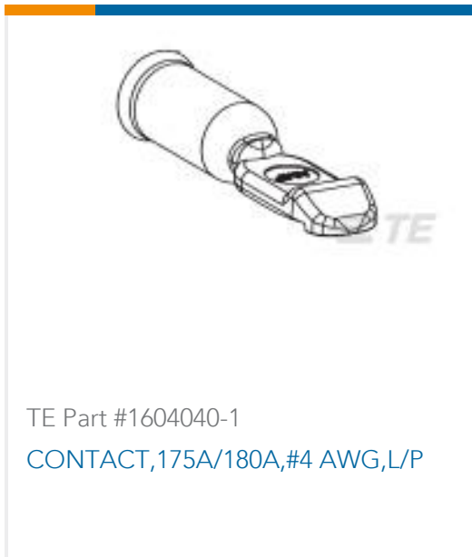
TE Part #1604040-1 CONTACT,175A/180A,#4 AWG,L/P