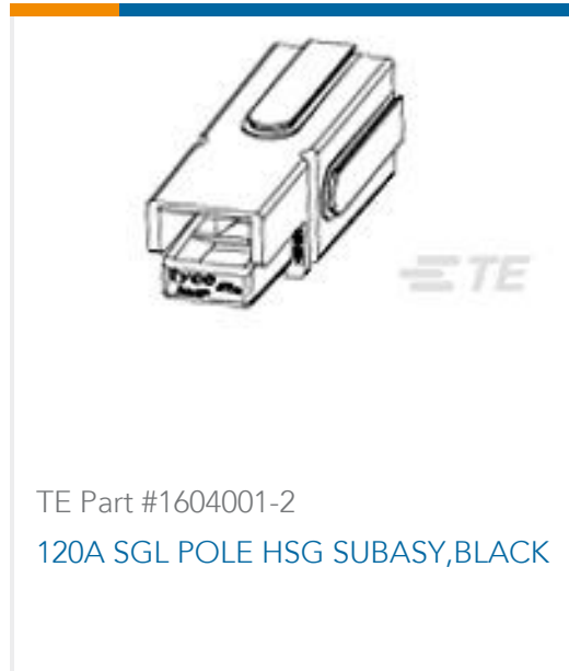
TE Part #1604001-2 120A SGL POLE HSG SUBASY,BLACK