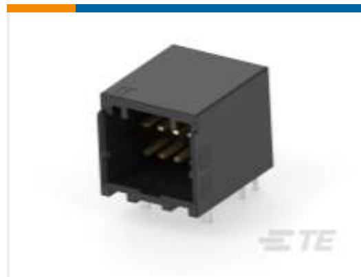
TE Part # CAT-D9934-A15E Header Assembly: Wire-to-Board, 3A, Gold or Tin Plated