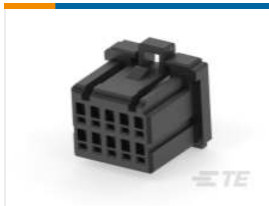
TE Part # CAT-D9934-A15A Receptacle and Tab Housing: 2.0 mm pitch, 125V