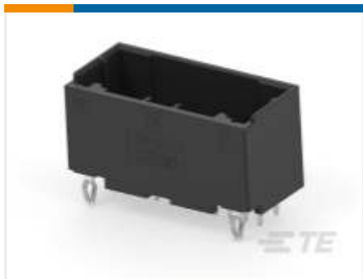
TE Part # 1-1871315-1 D1100D HDR ASSY V 22PX BLACK Pre-TIN