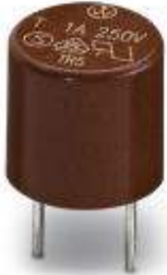
Replacement fuse, for INTERBUS-ST modules

Please be informed that the data shown in this PDF Document is generated from our Online Catalog. Please find the complete data in the user's documentation. Our General Terms of Use for Downloads are valid ( http://phoenixcontact.com/download )