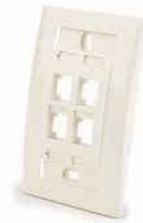
3M™ Wall Outlet with 3M™ Modular Adapter 8687 SC Inserts