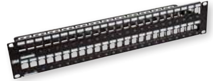
3M™ Copper Patch Panel 2RU, 48-port