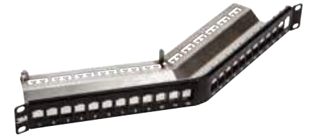
3M™ Angled Copper Patch Panel 1RU, 24-port