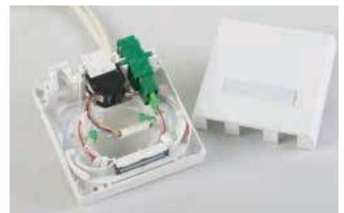
3M™ Modular Outlet 8686 shown with 2 SC connectors and a 3M™ RJ45 Jack.