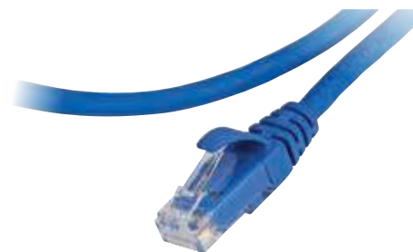
3M™ Copper Patch Cord

3M Copper Patch Cords help enable you to complete your channel to Category 6 (ANSI/TIA 568-C.2 and class E ISO 11801/EN50173). They are constructed with UTP stranded cable, PVC CM rated jacket and snagless latch to ensure durability. These patch cords are available in a variety of lengths and colors for easy cable management and administration.