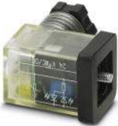
Valve connector, 3-pos., construction CI, 1 LED, with protective circuit, screw connection, M12 cable gland

Please be informed that the data shown in this PDF Document is generated from our Online Catalog. Please find the complete data in the user's documentation. Our General Terms of Use for Downloads are valid ( http://download.phoenixcontact.com )