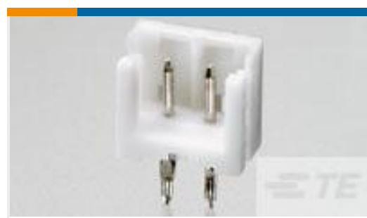
TE Part #177537-2 2.5 M.I.S. POST HDR ASSY 2P