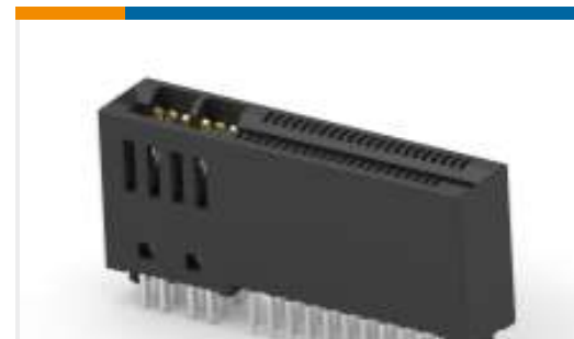
TE Part #2340164-3 2X2P-2X22S, VERTICAL,HD+ CE