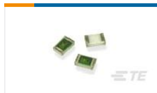
TE Part #9-2176088-8 RP 1J 0.166W 9K53 0.1% 25PPM 1K RL