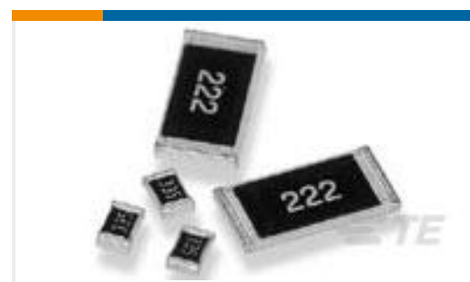
TE Part #1623254-1 CRG0805 1% 56K