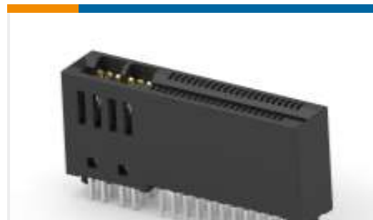
TE Part #2340164-2 2X2P-2X22S, VERTICAL,HD+ CE