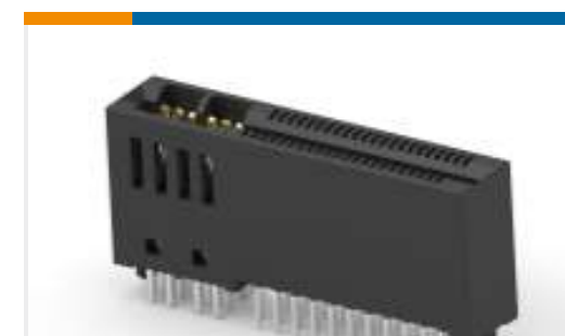
TE Part #2340164-1 2X2P-2X22S, VERTICAL,HD+ CE