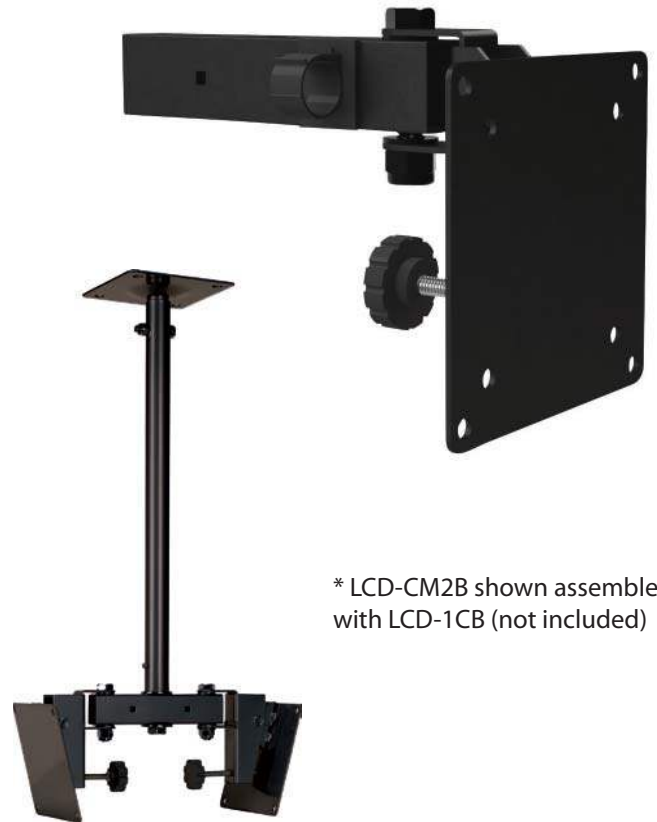
* LCD-CM2B shown assembled with LCD-1CB (not included)