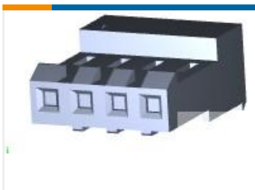
TE Part #3-641217-4 04P MTA156 CONN ASSY 18AWG ORA