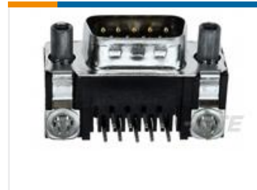
TE Part #747840-6 09 MSFL PLUG RA 318 (SL,FM,BL)