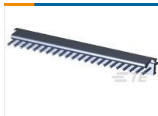
TE Part #2-640456-2 22P MTA100 HDR ASSY F/L SQ STR