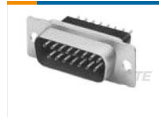
TE Part #5205733-7 09 PLUG SP/MS STD