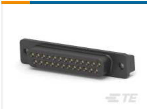
TE Part #5205736-7 D-Sub Receptacle Assembly: Vertical, Shell Size 3, 2.77mm