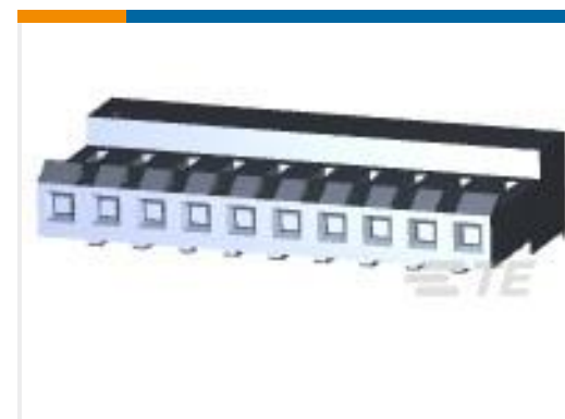
TE Part #4-641217-0 10P MTA156 CONN ASSY 18AWG ORA