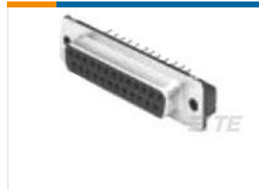
TE Part #1-747299-4 15 RCPT SP/FMS SCRLK