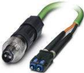
Assembled FO cable, round cable, 980/1000 µm POF fiber, M12 fiber optic connector to SC-RJ/IP20

Please be informed that the data shown in this PDF Document is generated from our Online Catalog. Please find the complete data in the user's documentation. Our General Terms of Use for Downloads are valid ( http://phoenixcontact.com/download )