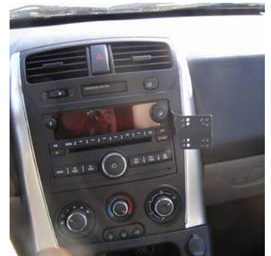
Saturn Vue 2006 Final Installation Picture

STEP #4: Replace the bezel carefully starting from the right side by the Installed Mount. INSTALLATION IS NOW COMPLETE. ENJOY YOUR NEW INDASH by PANAVISE MOUNT.