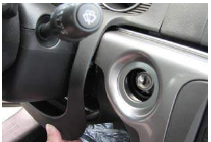
Ignition Switch Removed