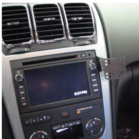
Final Installation Picture