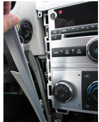
Radio Bezel Removal