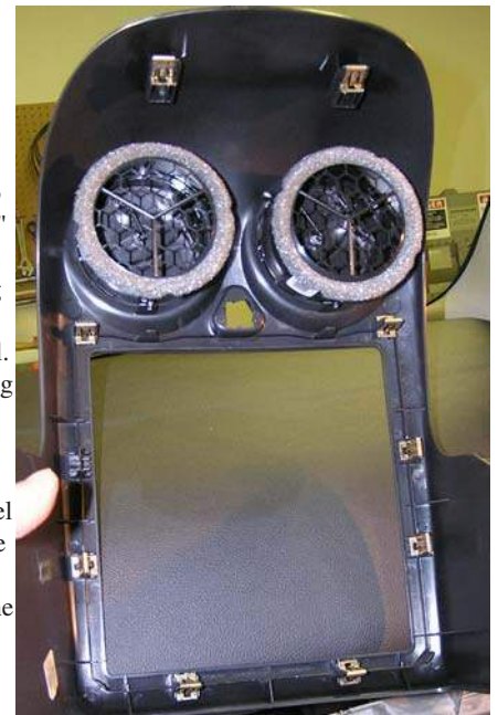
Radio bezel showing clip loca-

INSTALLATION IS NOW COMPLETE. ENJOY YOUR NEW INDASH by PANAVISE MOUNT.