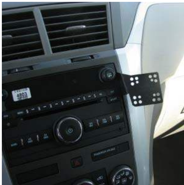
Installation of InDash Mount

INSTALLATION IS NOW COMPLETE ENJOY YOUR NEW INDASH by PANAVISE MOUNT