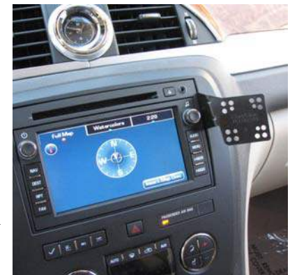
Buick Enclave Final Install Picture