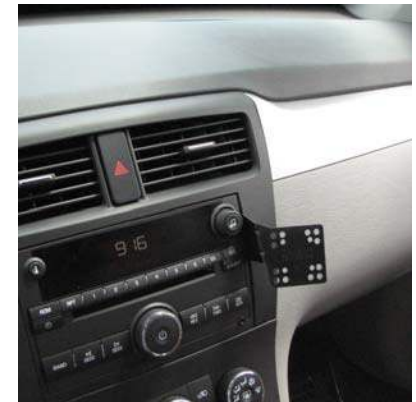
Suzuki XL-7 Final Install Picture