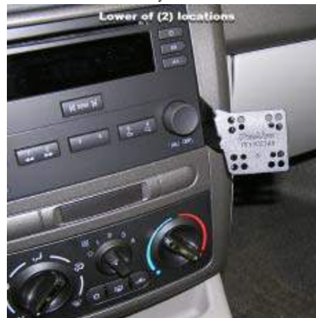
InDash Lower Mounting Location