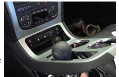
Shifter Console Removal

INSTALLATION IS NOW COMPLETE. ENJOY YOUR NEW INDASH by PANAVISE MOUNT.