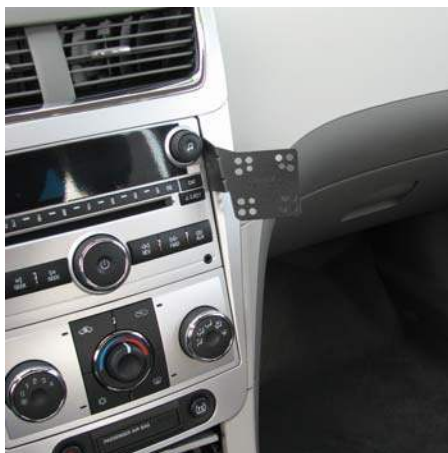
Final Installation Picture