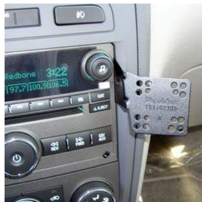
HHR Install Picture