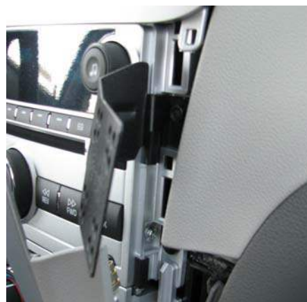
InDash Installed Showing Location