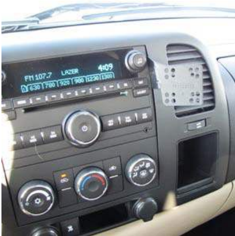
Installation of InDash Mount on Work Truck dash