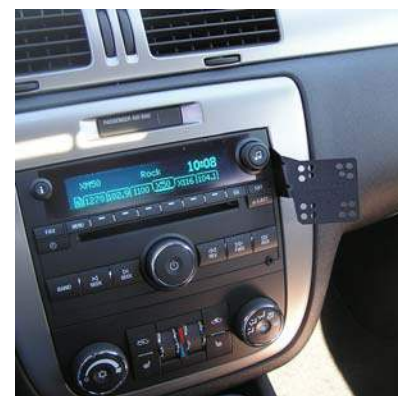
Impala, Monte Carlo Install Picture

Read instructions completely prior to starting installation. All InDash Mounts are designed so that after installation, phone is facing normal driver position for left-hand drive vehicles. This mount is not designed to be used in foreign countries with right-hand drive vehicles. Use extreme care when working around the plastic components on the dash. Excess force, can cause breakage of the plastic components.