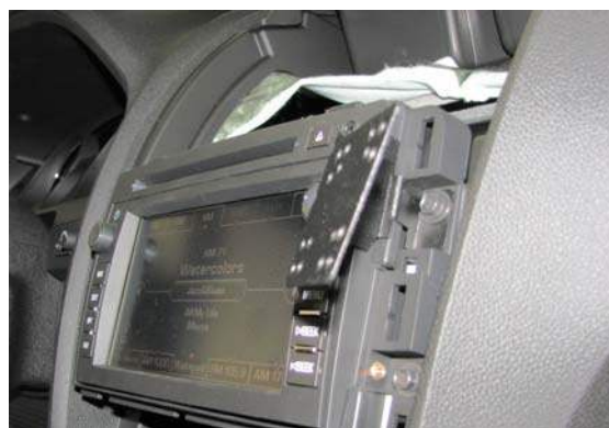
Mount in Place Showing Location