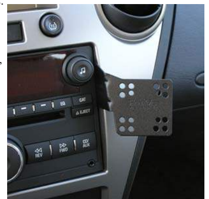
Saturn Ion Final Installation Picture