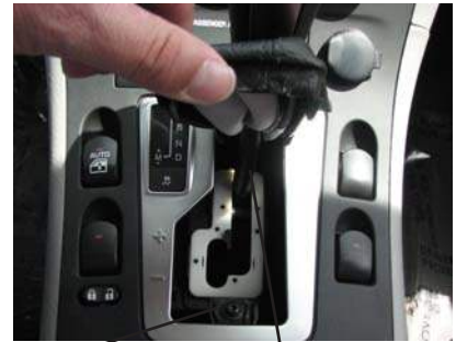
T-15 Torx Screw, T-10 Torx Screw

INSTALLATION IS NOW COMPLETE. ENJOY YOUR NEW INDASH by PANAVISE