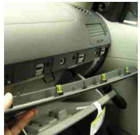
Trim Strip Removed

INSTALLATION IS NOW COMPLETE. ENJOY YOUR NEW INDASH by PANAVISE MOUNT.