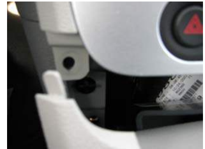
Flat Pins of Shifter Bezel

INSTALLATION IS NOW COMPLETE. ENJOY YOUR NEW INDASH by PANAVISE MOUNT