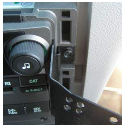
Mounting Location Picture - All