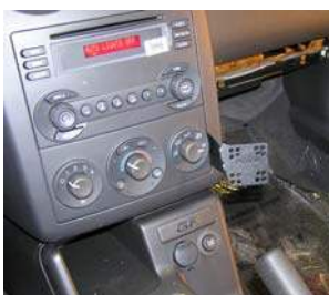
Final Installation Picture - G6