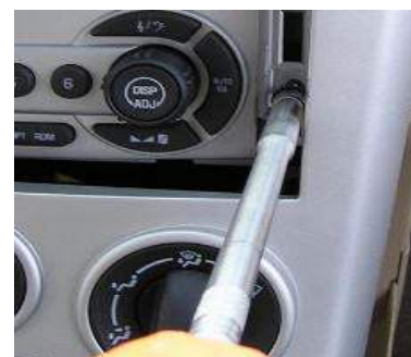
Lower Installation Location screw removal