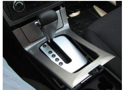
Shifter Bezel Removal