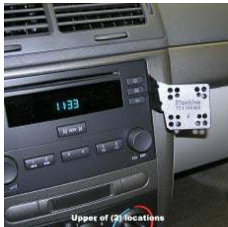
InDash Upper Mounting Location