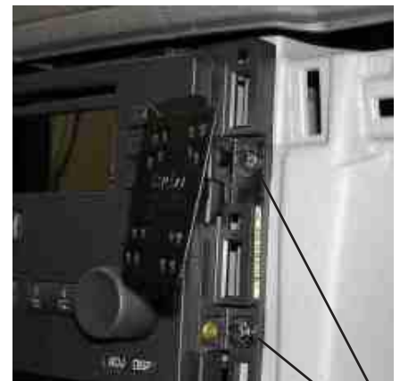
Upper Mounting Location Screw Lower Mounting Location Screw