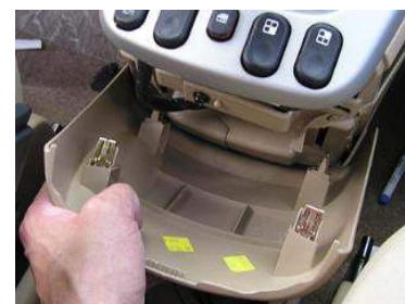
Removal of back cover

INSTALLATION IS NOW COMPLETE. ENJOY YOUR NEW INDASH by PANAVISE MOUNT.