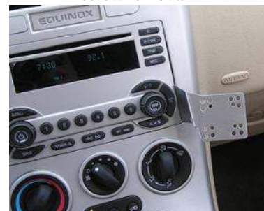
Lower Installation Location