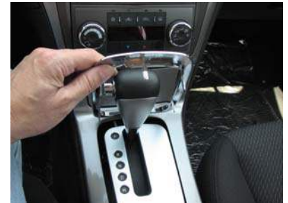
Shifter Bezel Ring Removal

Read instructions completely prior to starting installation. All InDash Mounts are designed so that after installation, phone is facing normal driver position for left-hand drive vehicles. This mount is not designed to be used in foreign countries with right-hand drive vehicles. Use extreme care when working around the plastic components on the dash. Excess force, can cause breakage of the plastic components.