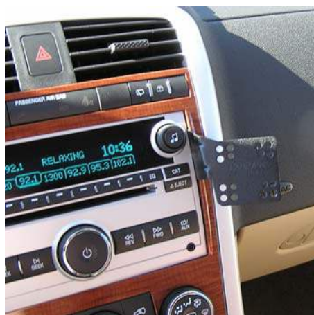
InDash installed showing upper location on new style radio.