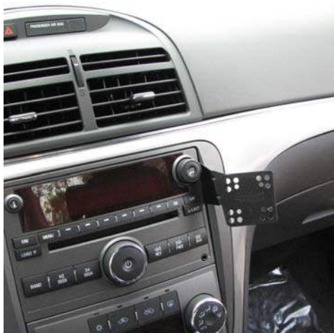
InDash Installed Showing Location

INSTALLATION IS NOW COMPLETE. ENJOY YOUR NEW INDASH by PANAVISE MOUNT.