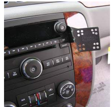
Chevy Tahoe, Suburban 2007

INSTALLATION IS NOW COMPLETE. ENJOY YOUR NEW INDASH by PANAVISE MOUNT.