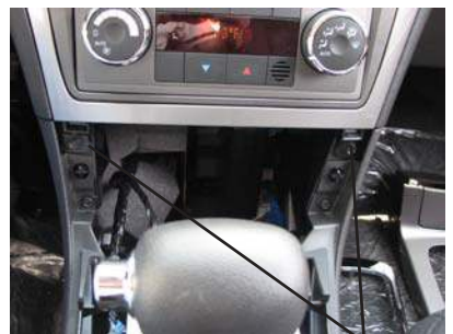
Climate Control Screws