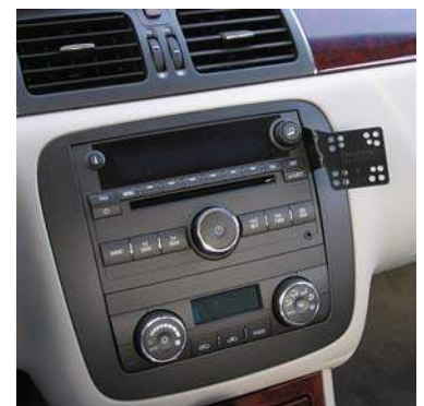
Buick Lucerne 2006