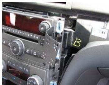
Mount in Place