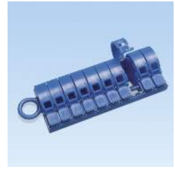
PMD EMPTY DISPENSER