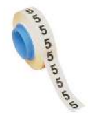
PMDR - *