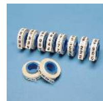
PMDR - * - *