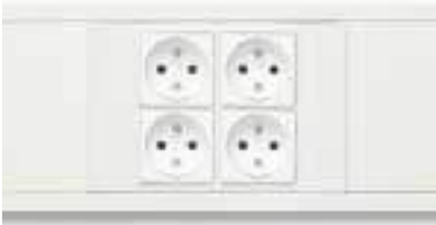
45x45 Modules (French) shown in T130FFMC.*