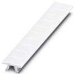
Zack marker strip, 10-section, vertically labeled with the consecutive numbers: 1 ... 10, white, width: 6 mm

Please be informed that the data shown in this PDF Document is generated from our Online Catalog. Please find the complete data in the user's documentation. Our General Terms of Use for Downloads are valid ( http://phoenixcontact.com/download )